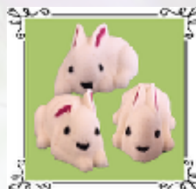
Our Bunny Bath Bombs!